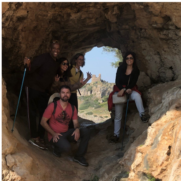
Nardò. Porto Selvaggio Natural Park