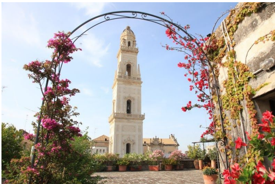
Lecce. Vista dalla terrazza di Palazzo Rollo. Campanile del Duomo di Lecce.