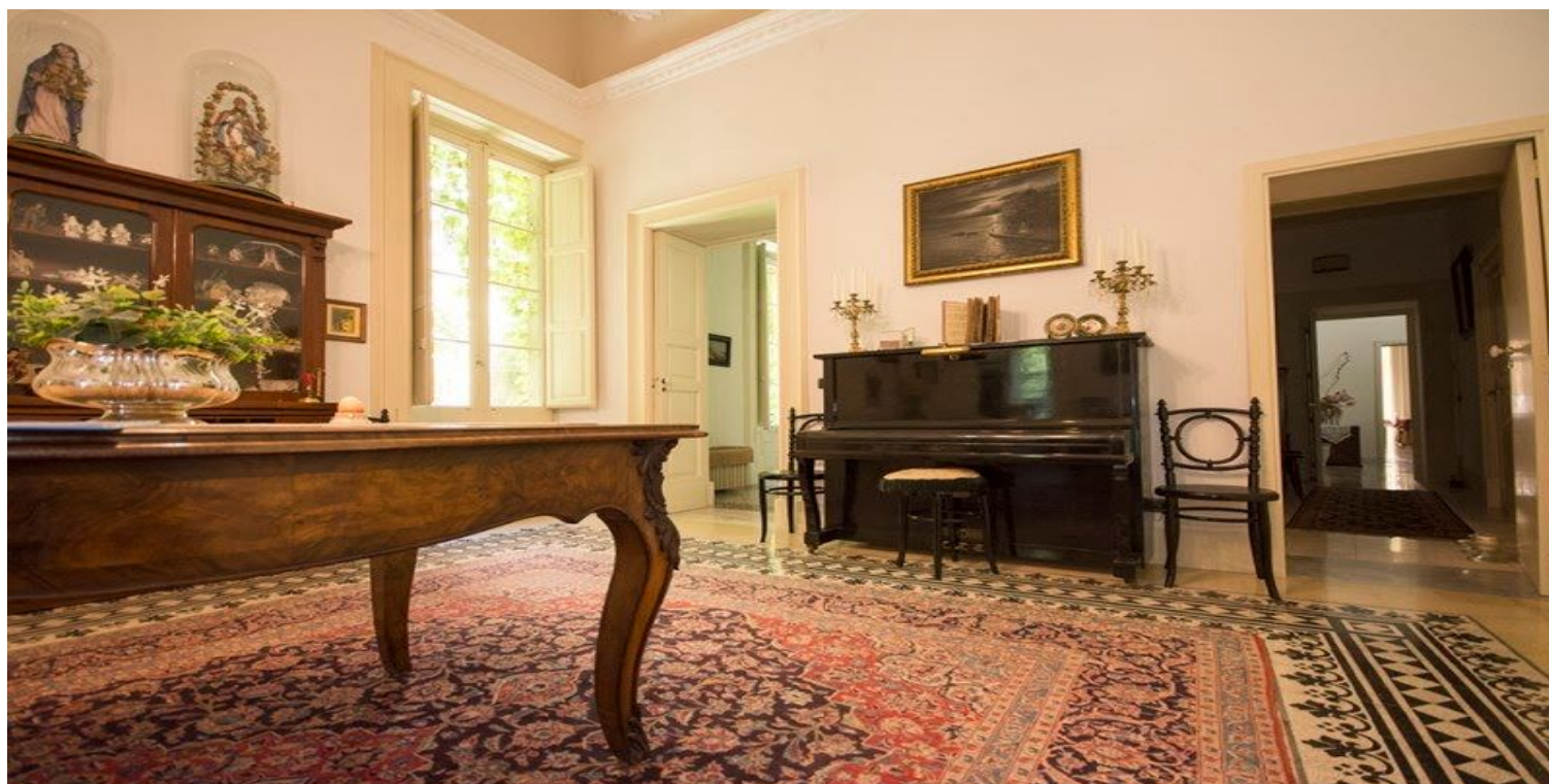
Dimora Storica Palazzo Rollo (Lecce)

The B&B Palazzo Rollo is located in the historic center of Lecce, scenically overlooking the suggestive bell tower of the Cathedral. The structure was subjected to a restoration work that allowed to recover the ancient beauty and all the original charm of the building, respecting a unique space with a great atmosphere.