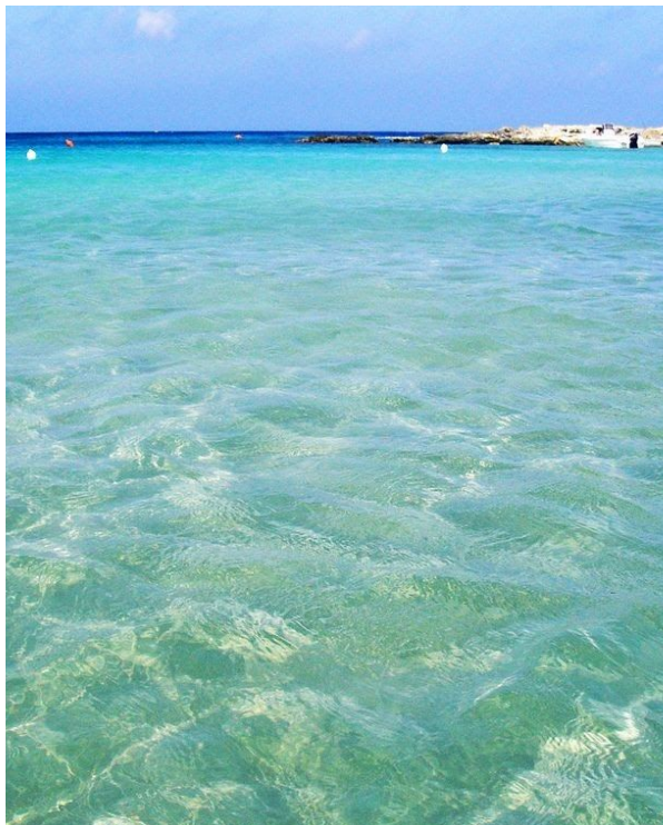
Gallipoli. Acque cristalline

07:30 Rich buffet breakfast in the restaurant dining room.