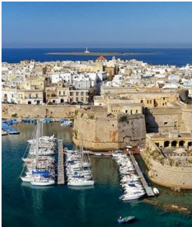
Gallipoli. Il castello angioino.