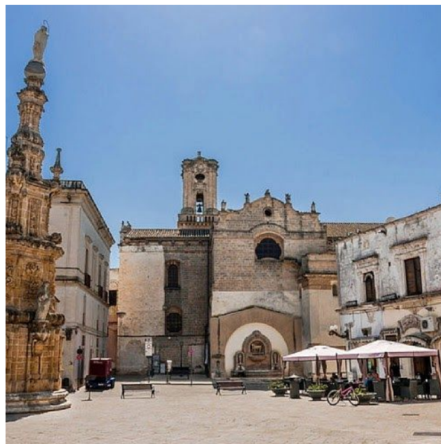
Piazza Salandra, Nardò.