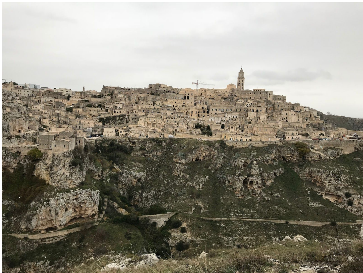
Sassi di Matera.