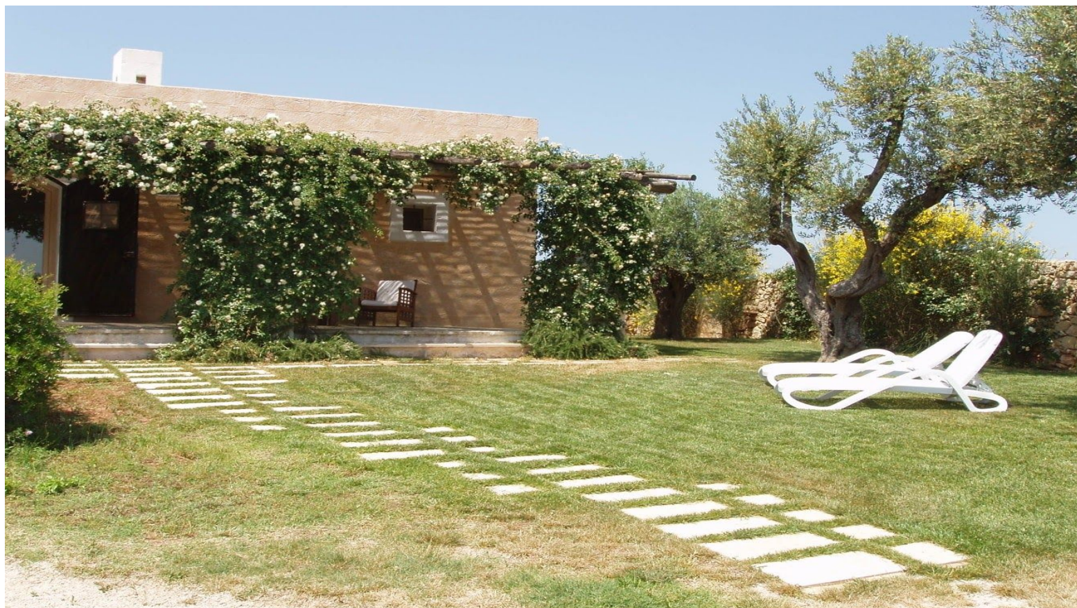
Masseria L'Antico Frantoio (Gallipoli)

Hotel " Masseria L'Antico Frantoio " is located in Gallipoli, in Salento, surrounded by nature. The hotel dated 17th century was an ancient oil mill restored in its original structure. Today it also has a restaurant and a wellness center.