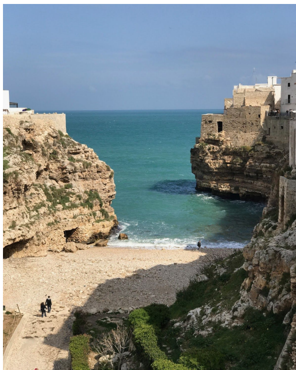
Polignano a mare.